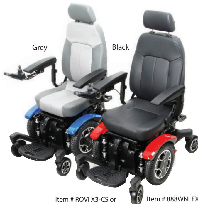
Item # ROVI X3-CS or Item # 888WNLEX3-SP-CS