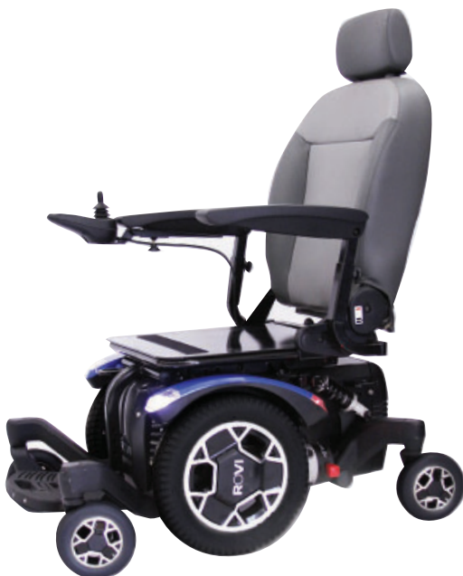
Item # ROVI X3-SS or Item # 888WNLEX3-SP-SS